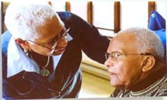
Duke Family Support Program November 2015